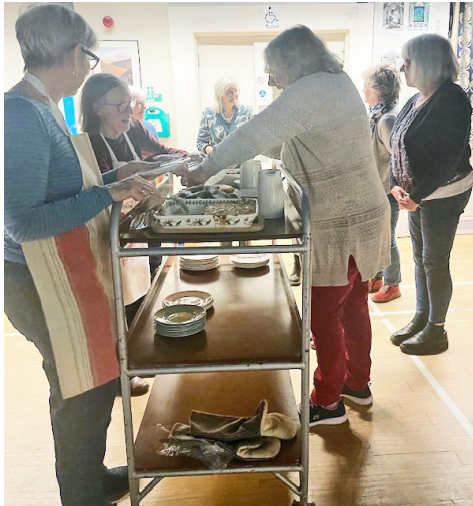
February Supper Club: "Time for dessert."