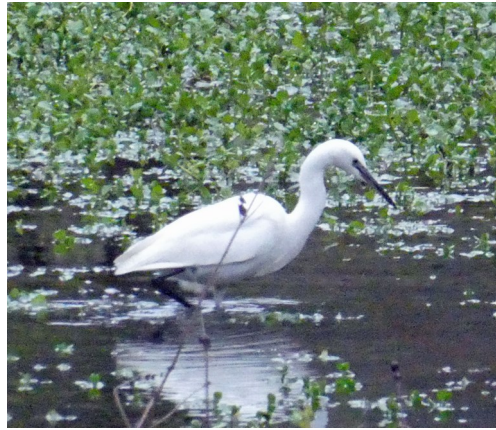
Little Egret on the fourth dam.

Two little egrets have been around near the New Dam and by the river and a great white egret was reported. Although great white egrets are big, the size of a heron, size is not always easy to assess in isolation. Always look at the beak. The great white has a yellow beak, the little egret has a black beak and huge yellow feet though you can't always see these when they're wading. Exotic looking mandarin ducks have been common on the New Dam along with several goosanders. Our new cygnet seems well established on the river and has been accompanied by a dabchick. Flood water below Raper Bridge has attracted some gadwall, a duck not often reported around the village. Lapwings have been back on