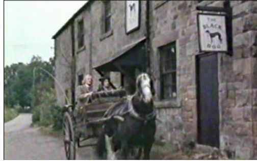
The Cheese Factory recreated as the Black Dog inn for the film.

the river scenes, swimming and drowning, were shot in Monsal Dale. He identified his childhood home at Brushfield in the background. So it was not, as I had previously guessed, shot in Lathkill Dale.