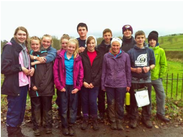
The Bronze DofE group.

This past year we have been training a group of 12 young people from the village and surrounding area in navigational skills, camp craft and teamwork skills in order for them to complete practice and qualifying expeditions for their Bronze D of E Award. They had to walk for two full days for each weekend, carrying everything in rucksacks to allow them to be self-sufficient. They camped in VERY cold conditions and cooked all their meals on tranga stoves. The