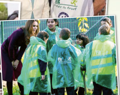
Children show their outdoor workbooks to The Duchess in Newcastle