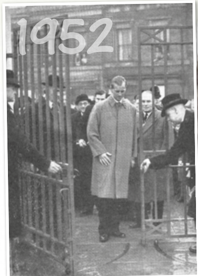
Opening King George V Field in Stepney