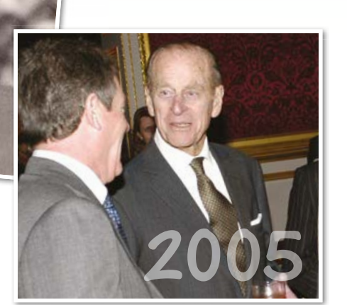
Royal Lunch celebrating the 80th Anniversary of the NPFA