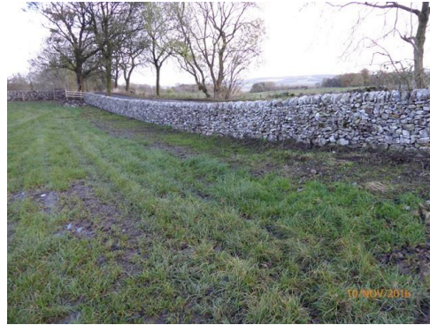
Before and after walling restoration near Middleton.

More than 5km of traditional drystone walls and 0.5km of hedges are being restored across the National Park thanks to grants from the Countryside Stewardship Hedgerows & Boundaries Grant Scheme.