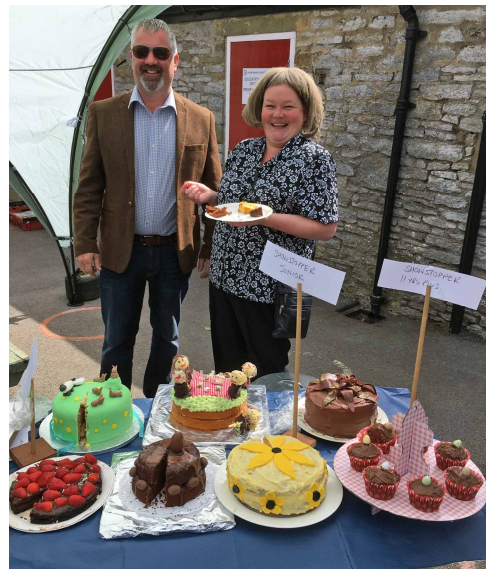
Paul Hollywood and Mary Berry lookalikes judging the baking competition.