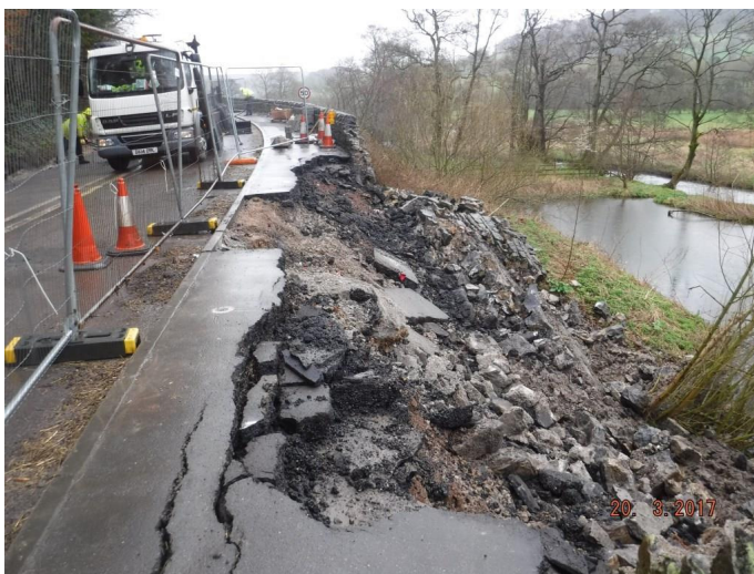
Above: The collapsed retaining wall near Bowers Hall.

The work on the B5056 is due to end by 12 April, but if as seems likely the