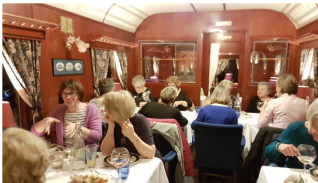
Above and below: Dinner at Carriages at Newhaven.